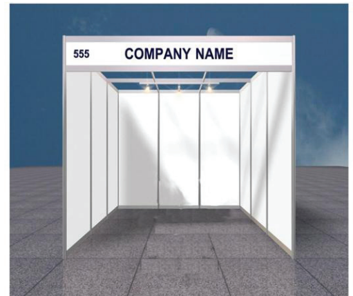
Shell Scheme Stand Sketch (For illustrative purposes only)

Space only / shell scheme rental does not include any furniture, electrical usage or stand cleaning. All these services and others will be available to order in the Exhibitors' Technical Manual.