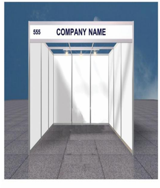
Shell Scheme Stand Sketch (For illustrative purposes only)

Space Allocation will be made on a "first-come-first-served" basis. A completed Booking Form and Contract should be faxed / emailed to ensure reservation of a desired location. Upon receipt of the Booking Form and Contract, space will be confirmed and an invoice will be mailed. Please note that three alternative choices should be clearly indicated on the application form. Space allocations will be made in the order in which application forms with payment are received.